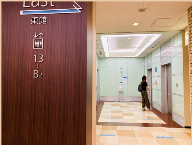
04/ Take the elevator to 1F.