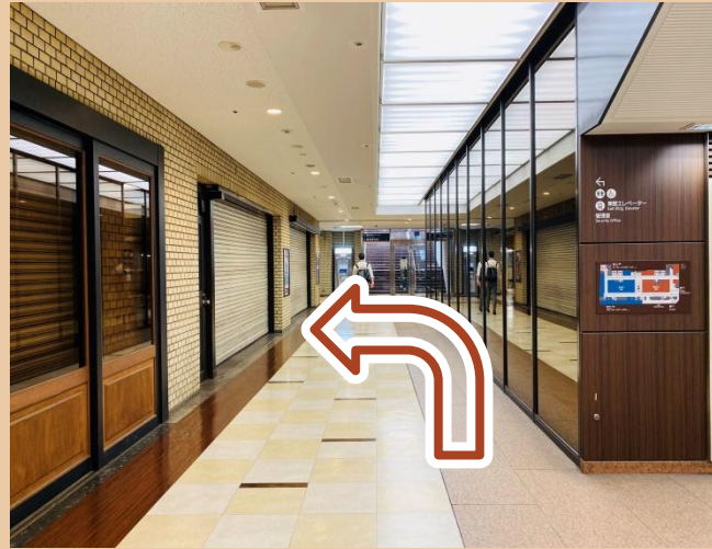
02/ Go straight and turn left.