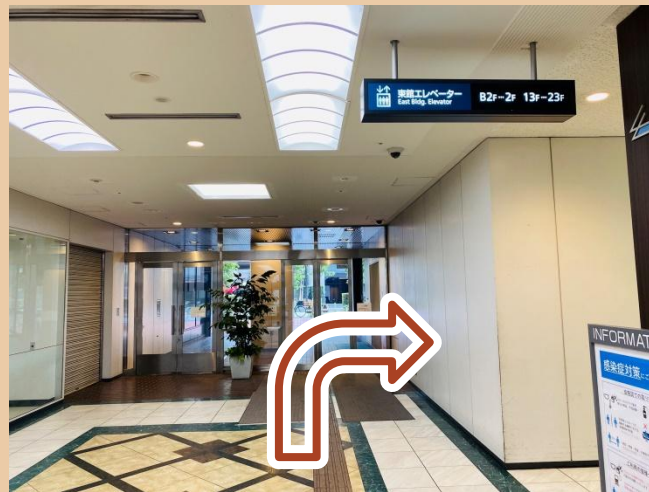
05/ Come out and turn right.