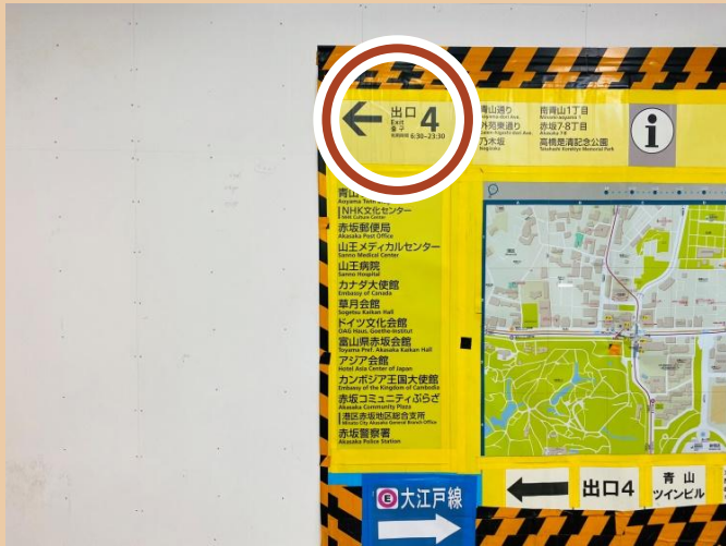
01/ Follow the direction of Exit 4 .