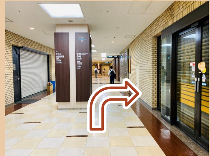
03/ Go straight and turn right.