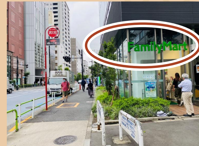
06/ Go straight and you will see FamilyMart , and our staff will be waiting there