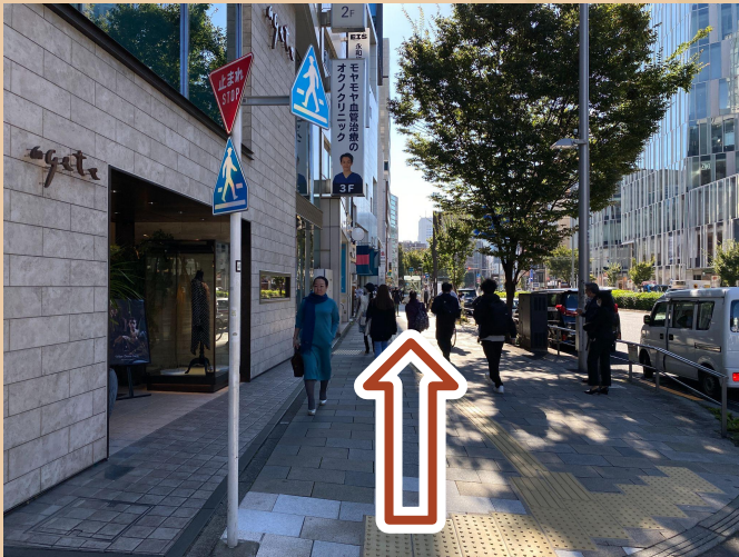
07/ After turning left, go straight ahead