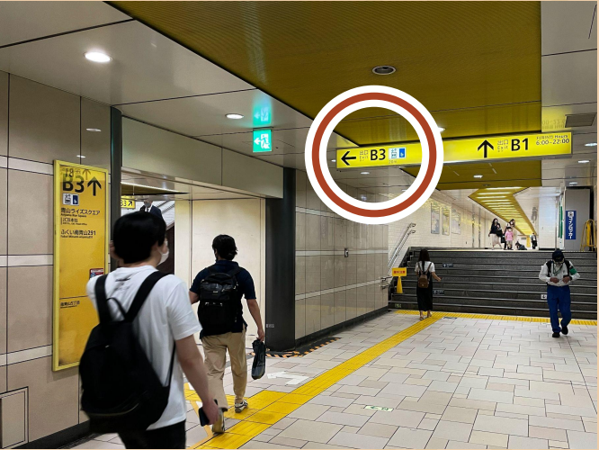
04/ Take the escalator at Exit B3