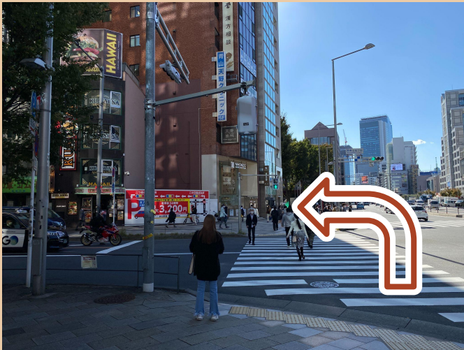
08/ Cross the road and stay on the left side