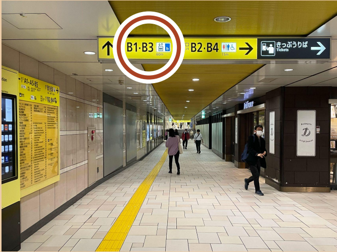
03/ Follow the signs straight ahead