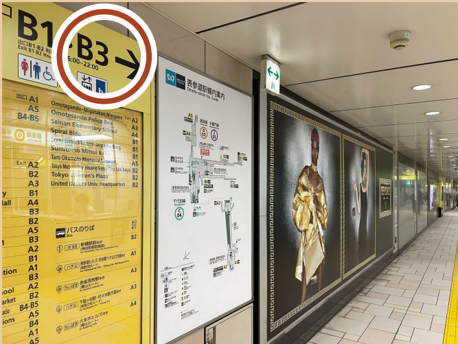
02/ Follow the signage signs