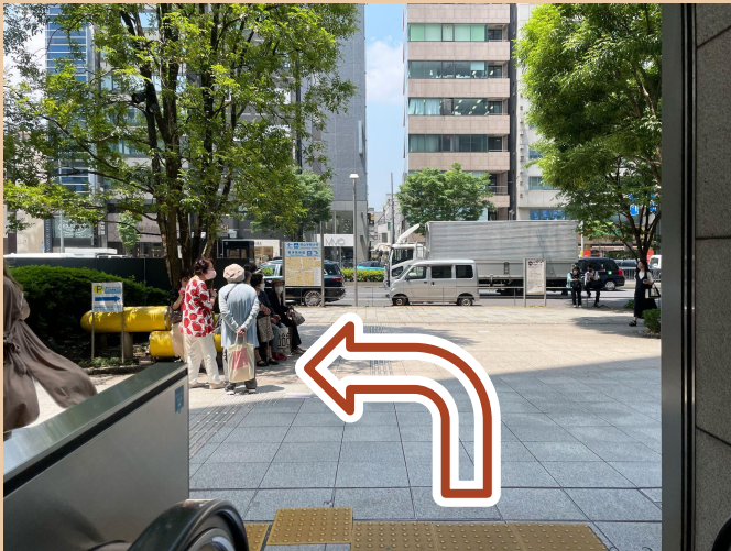
06/ Go to the left direction after reaching the ground