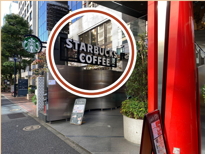
09/ You will see STARBUCKS , and our staff will be waiting there