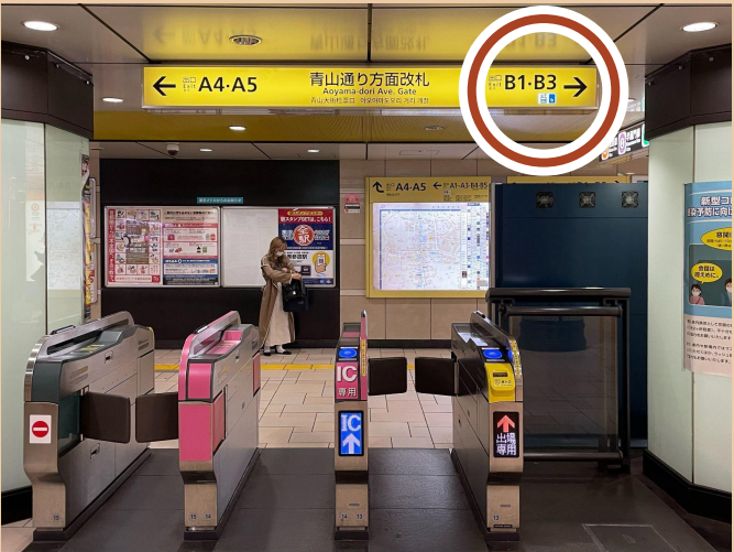
01/ Use the Exit B3 of the station