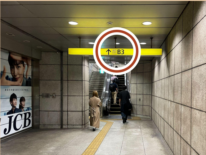
05/ Take the second escalator to the ground