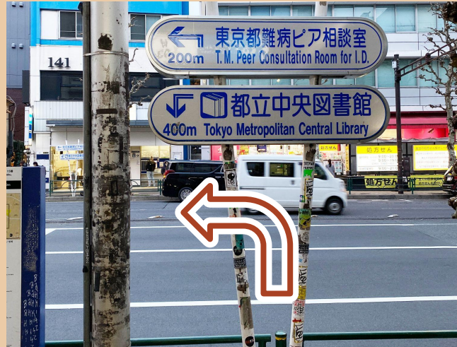
02/ At the exit, turn left.