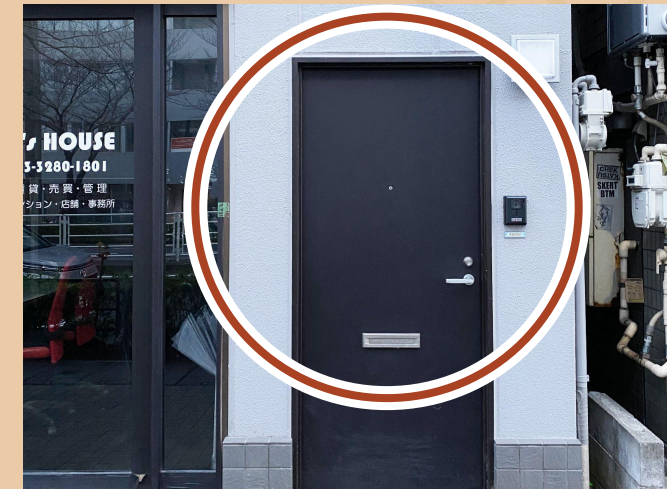
06/ Keep walking to our meeting point, and our staff will be there to host you in person.