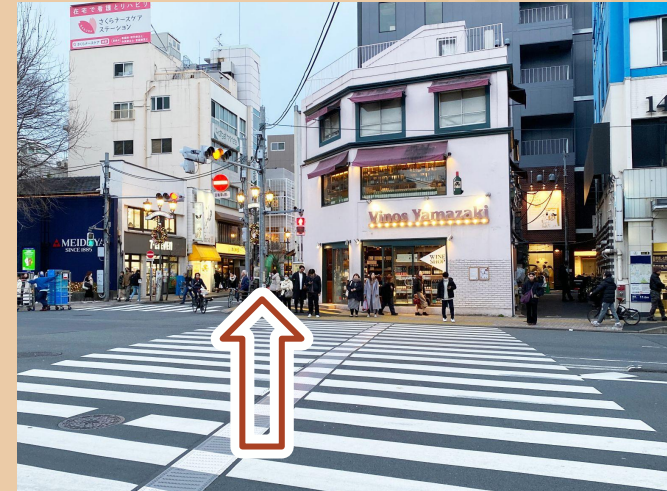
03/ Cross the road