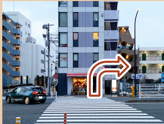
05/ Cross the road at the traffic lights, then make a right run.