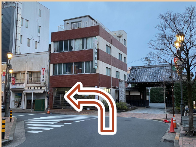
04/ Walk all the way down in the walking street, then turn left